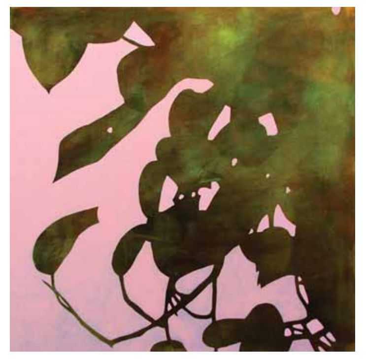
Mark Dixon, Untitled, 2005. Acrylic on canvas, 60 × 60 cm. © Mark Dixon. 1971–, Canada