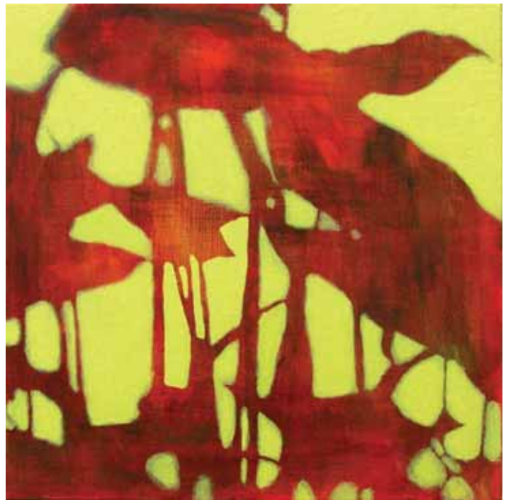
Mark Dixon, Untitled, 2005. Acrylic on board, 20 × 20 cm. © Mark Dixon.